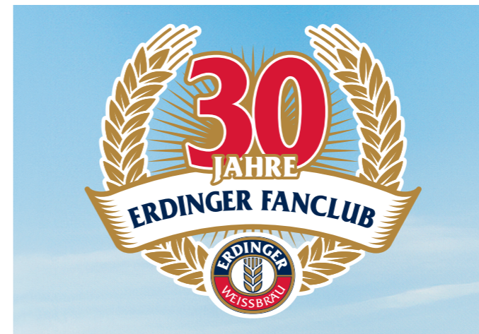
12 Anniversary: We look back on 30 years of the ERDINGER Fan Club, what connects you to our brewery, and what you can expect in this fan year.