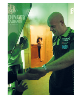
Dutch megastar Michael van Gerwen – pictured here making his typical walk-on – took plenty of time for his fans in Erding.

Tickets available here: www.pdc-europe.tv/de/events