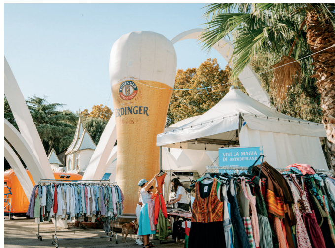
Visitors were able to purchase or borrow traditional Bavarian costumes at the event.

sandwiches and dolci to Bavarian sausages and, of course, our delicious beer specialities ERDINGER Weissbier with fine yeast, ERDINGER Alkoholfrei and ERDINGER Brauhaus Helles. A total of 12,000 litres of ERDINGER were served: proving just how well these worlds of enjoyment harmonise with each other. In addition to culinary delights and entertainment, visitors were also treated to a colourful traditional costume market, offering original “lederhosen” and “dirndls”. “Oktoberland Naples” clearly demonstrated that the Bavarian love of life and South Italian charm are a match made in heaven. An event that leaves you wanting more! ♦