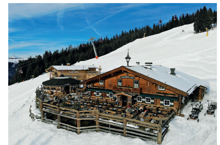
22 Bars, ski huts, restaurants: Whether you want a mid-day snack or some après-ski fun, we'd like to introduce you to some of our catering partners in Austria.