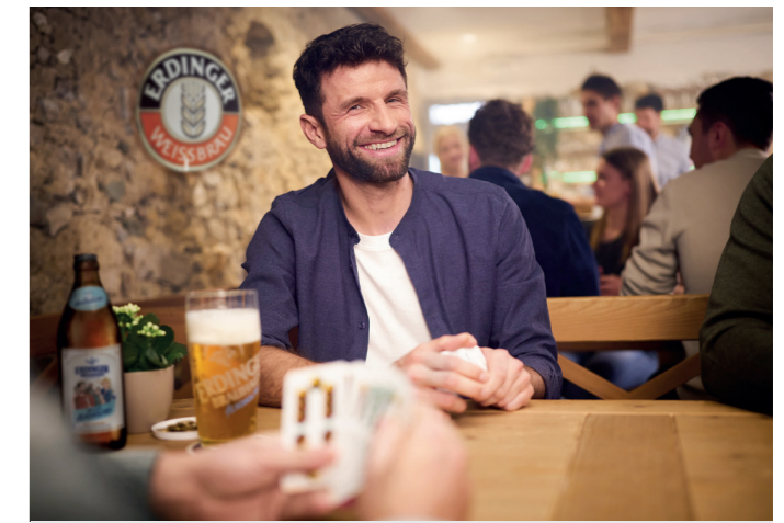
08 Two Bavarian originals: Thomas Müller and our brewery share authenticity, humour and a genuine love of life – the perfect match!