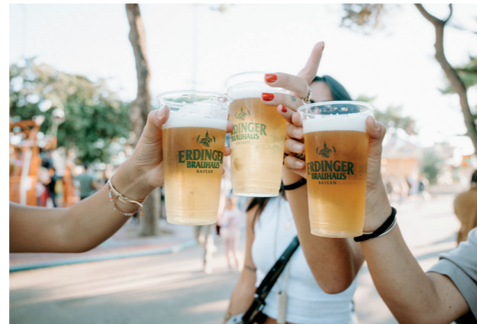
Our delicious ERDINGER Brauhaus beer was well received by Oktoberland fans in Naples.