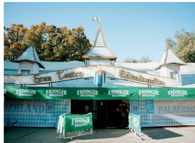
A taste of Bavaria at the Italian amusement park Edenlandia.