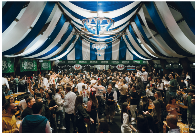
Perfect match: Bavarian love of life meets Italian charm.

Oktoberland – At the first “Oktoberland Naples”, Italy’s historic amusement park was transformed into a Bavarian festival ground, and ERDINGER was right at the heart of it.