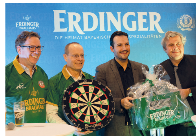
21 Game on: When world-class darts meets party atmosphere at the sensational PDC Europe events, ERDINGER Brauhaus is at the heart of the action.