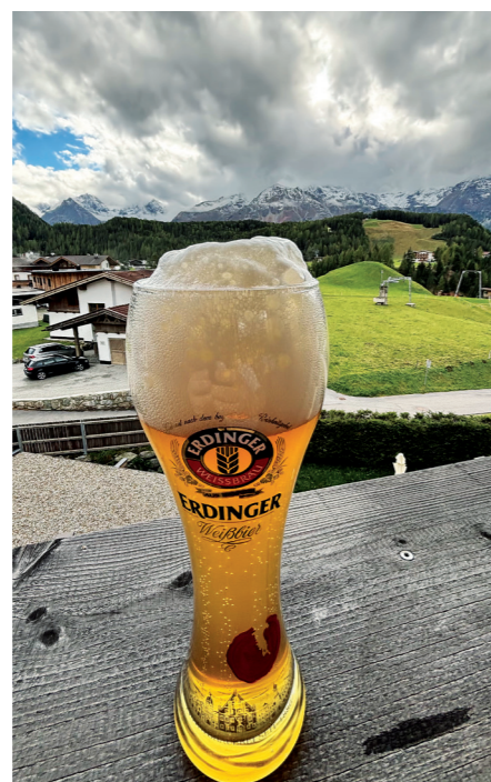
Markus Titze savours this magnificent Tyrolean panorama with a delicious ERDINGER Weissbier.